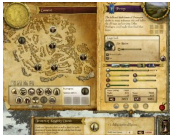
Improving a citadel.

accurate as it has a lot of fantasy / mythological elements in it. Your heroes can collect powerful magical equipment ( even some unique artifacts) and learn spells to cast next to being able to learn skills that can be quite incredible as well. In terms of units there are a number of regular units next to more fantastical mythological units. The same applies to the rest of the game, some stuff is pretty mundane, like quelling an uprising or fighting catholic armies. The next moment however you can be doing a quest where you have to do stuff with the Sidhe in an alternate dimension. All in all I was really impressed by the depth and amount of lore present in the game. I should probably also add that your heroes and units can level up in the winter, which can give heroes extra attribute points, improved skills or even new skills (each knight has a class which governs which skills are available). Even units have a few (sometimes unique) skills they can acquire when they level up further. Note: Knights have to stand next to each other to swap equipment; that could have been made easier.